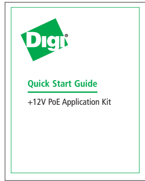
This Quick Start Guide